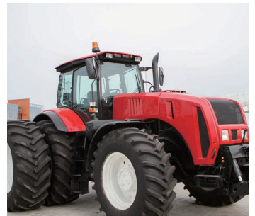
Automatic Driving of Agricultural Machinery